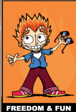
FREEDOM & FUN