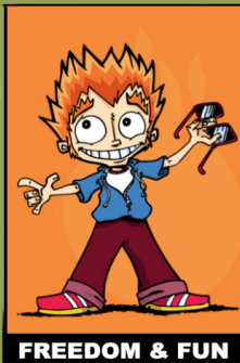
FREEDOM & FUN